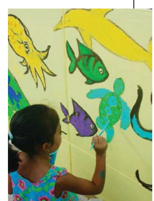
A child helps paint a sea-life mural at the BIC.

You can help! Join STC on December 1st, 2015 for #GivingTuesday. Use this hashtag and tag Sea Turtle Conservancy on Facebook, Twitter and Instagram to show your support of educational programs in Florida.